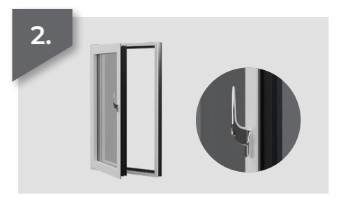
Return window to the closed position before turning the handle 180° to open the window inwards