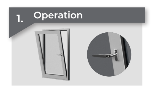
Turn the handle 90° to tilt the window for ventilation