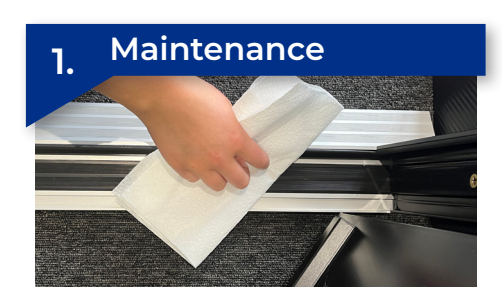
Clean away any dirt or debris from the hinges and threshold