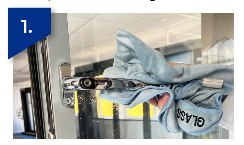
Clean the inside and outside of frames and handles from top to bottom once every 3 months

We recommend the following for all products including lanterns: