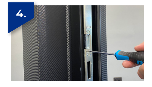
Check the tightness and security of all fixings, tightening as required