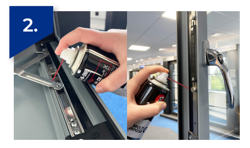
Add a small amount of lubricant at each pivot point and locking part*