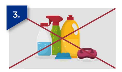
Avoid using any chemicals or abrasive cloths as this could damage the powder coated finish