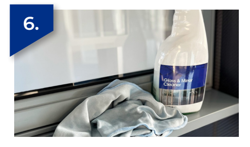
Use a standard household glass cleaner and a soft, lint free cloth