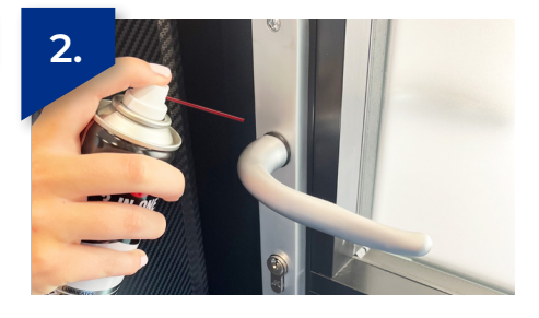
Use a light machine oil on moving handle parts, but not the lock cylinder