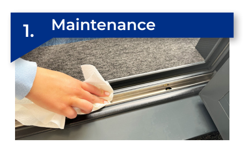
Once you've followed the instructions on page 6, wipe away any dirt or debris from the track to ensure the smooth operation of the rollers