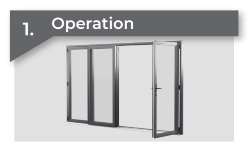
To avoid mishandling, always fold back each door sash fully before opening the next section*