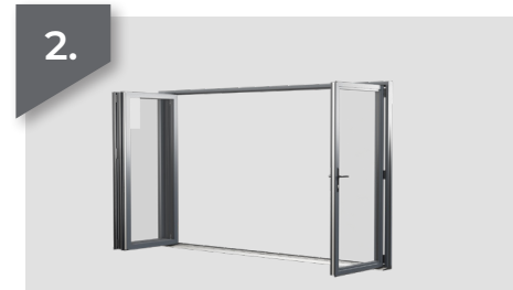
Ensure doors are held in place via the magnets when open