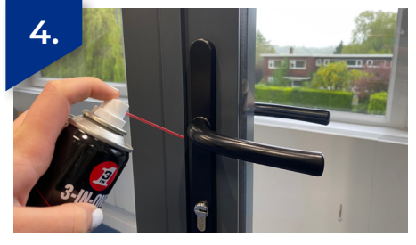
Use a light machine oil on moving handle parts, but not the lock cylinder